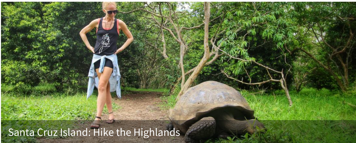
Santa Cruz Island: Hike the Highlands

Wake up with the sea breeze as we travel by speedboat or internal flight to Santa Cruz Island, keeping an eye out for whales and dolphins along the way. After checking in at the hotel we head to El Chato in the Santa Cruz highlands to find the famous giant tortoise in its natural habitat. It is truly an honor to walk in the stately presence of these gentle giants, who can live to be over 175 years old. We will also see pintail ducks, Darwin's finches, frigate birds, egrets, and the vermilion flycatcher.