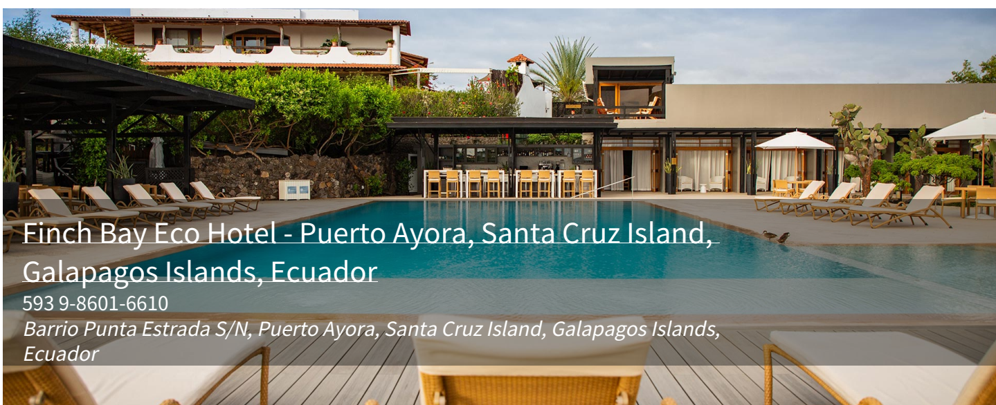
Finch Bay Eco Hotel - Puerto Ayora, Santa Cruz Island, Galapagos Islands, Ecuador

Our next stop is the incredible lava tunnels, which formed an ideal hideout for the pirates that once frequented the Galapagos. Legend has it that they were also used to hide Inca gold stolen from Spanish ships. We then hike on to Los Gemelos, two deep volcanic sinkholes at the top of the island, with rocky cliffs surrounding the huge pits of empty magma chambers. Our path takes us through a forest of endemic Scalesia trees, where we will be on the lookout for the elusive short-eared owl. The trees are covered with ferns and epiphytes, and lend the forest a quiet, eerie feel